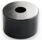
P50FR or P75R