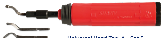
Universal Hand Tool A - Set E