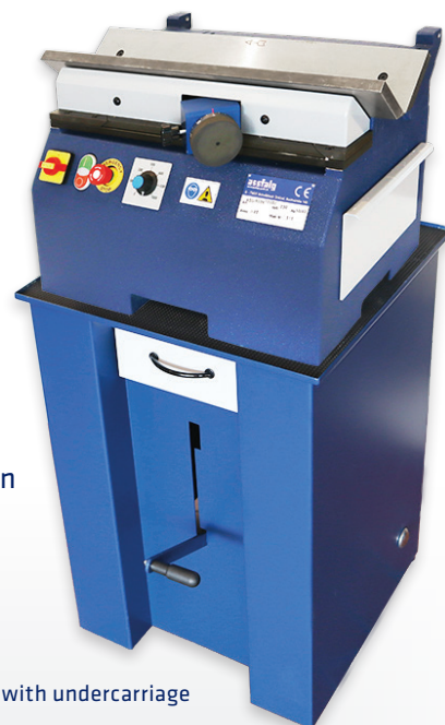
ASO 850-K with undercarriage

The stable and simple edge milling machine is designed for deburring and edge milling of small to large workpieces from 2mm thickness. Thanks to the optimized interaction of cutter head and inserts, the machine provides chatter-free, clean and constant chamfering performance up to 3mm x 45° in one cut.