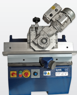
ASO 850-K with feed module