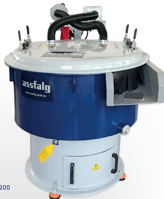
Accessories on request